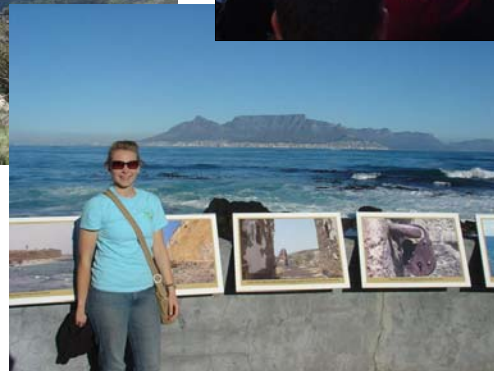
THE VIEW OF CAPE TOWN FROM ROBBEN ISLAND. ONE OF THE BEST TOURS I'VE BEEN ON— MINUS THE NAUSEATING FERRY RIDE TO THE ISLAND.