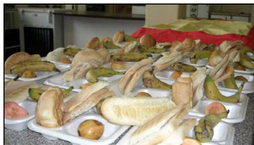
A TYPICAL LUNCH AT LIVING GRACE— BREAD, TWO PIECES OF FRUIT, IN ADDITION TO STEW.