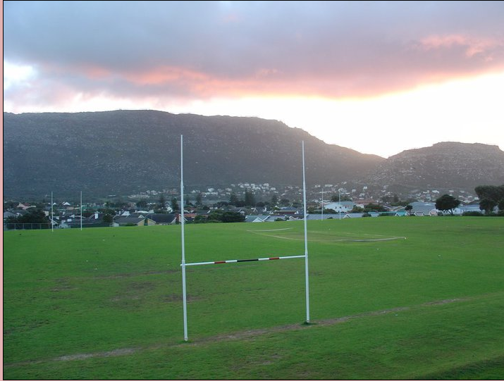
A BEAUTIFUL FISH HOEK SUNRISE. THESE ROLLING HILLS ENCIRCLE CAPE TOWN AND THE SURROUNDING TOWNSHIPS AND SUBURBS.

This is a rugby pitch (field) where Living Hope sponsored the Two Oceans Soccer Tournament— July 9, 2010. In addition to soccer and netball (a game similar to basketball), the kids got to see a magician, an artist, a local performing arts ministry and participate in craft time.