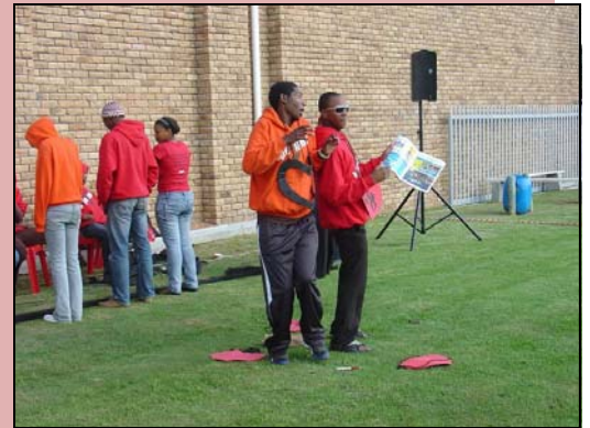
VOYU AND HOPE 2 AFRICA AT THE TWO OCEANS TOURNAMENT. THIS IS A DRAMA WITH SONG. THE MESSAGE OF THIS PRESENTATION WAS THAT ONLY GOD CAN FILL THE HOLE IN OUR HEARTS.