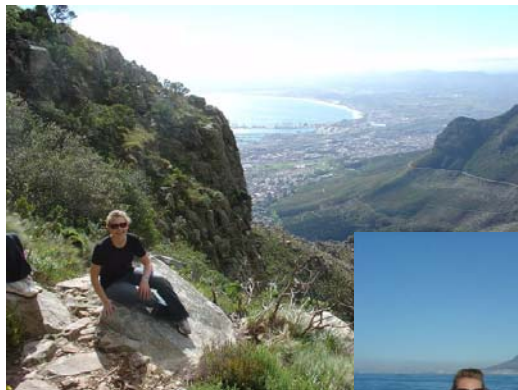
BAY AS SEEN FROM THE HIKE UP TABLE MOUNTAIN. THIS WAS MORE LIKE A CLIMB & TOOK OVER 3