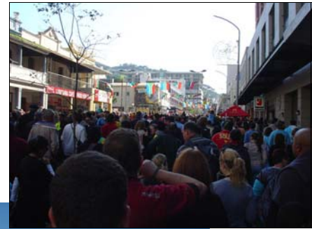
CAPE TOWN FAN WALK DURING THE WORLD CUP.